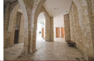
Tassos Papadopoulos Building Ground Floor: Registration desk and lunch breaks 1st and 2nd Floors: Rooms 1, 2, 3, 4, 5, 6