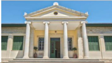
Andreas Themistocleous Building Rooms: "Lefkosia", "Larnaca", "Lemesos", "Kerynia", "Pafos", "Ammochostos", Amphitheatre