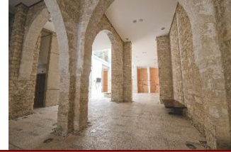
Tassos Papadopoulos Building Ground Floor: Registration desk and lunch breaks 1st and 2nd Floors: Rooms 1, 2, 3, 4, 5, 6